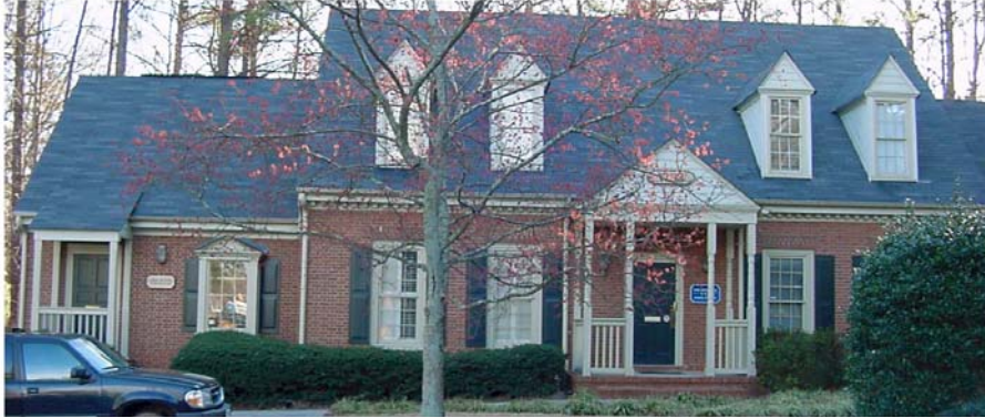
1733 Mt. Vernon Road