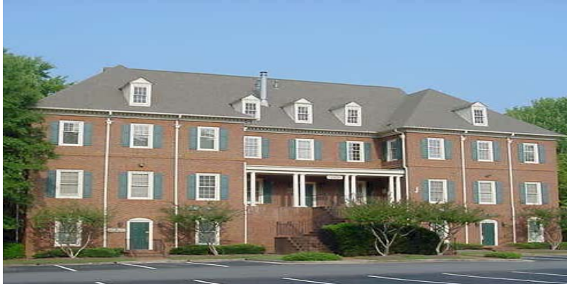
Habersham at Northlake Office Park – Building J